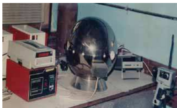
Optical Profiler (surface finish and step height)