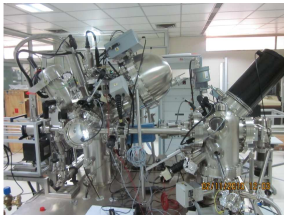
Multi-technique Surface Analysis System (XPS, UPS, ISS, AES, SAM, SEM, LT-STM, LT-AFM, LEED)