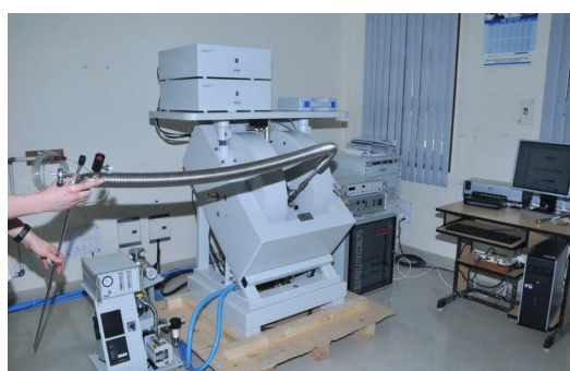
Electron Paramagnetic Resonance Spectroscopy (Bruker Biospin A 300)