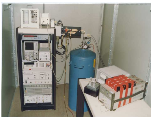
Josephson Series Array Standard at 1 Volt Level