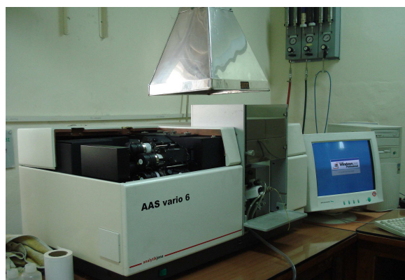
Flame Atomic Absorption Spectrometer ( AAS Vario 6 )