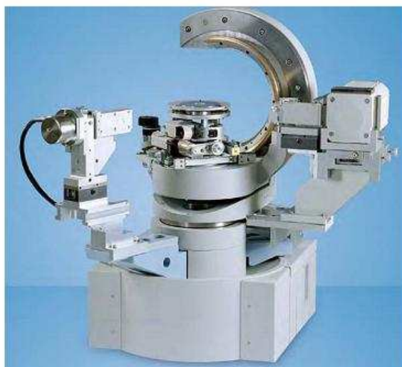
High-Resolution X-ray diffractometry and X-ray reflectometry