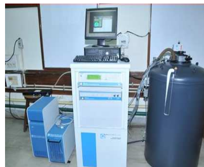
Physical Property Measurement System (14 Tesla)