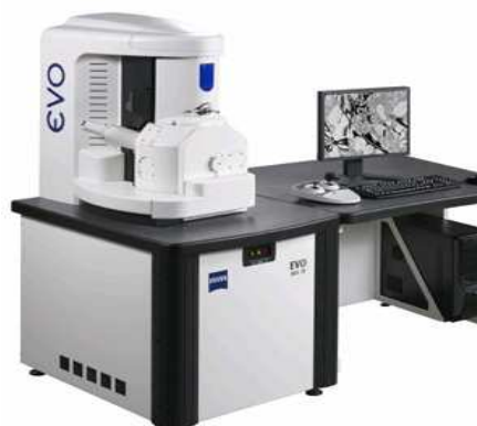
Scanning Electron Microscope (EVO MA10)