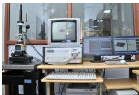
Scanning Probe Microscopy (Multimode Nanoscope V, Veeco Instruments, USA)