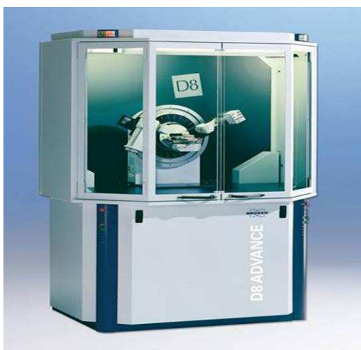
Powder X-Ray diffractometer (Bruker X-ray diffractometer D-8 Advance)