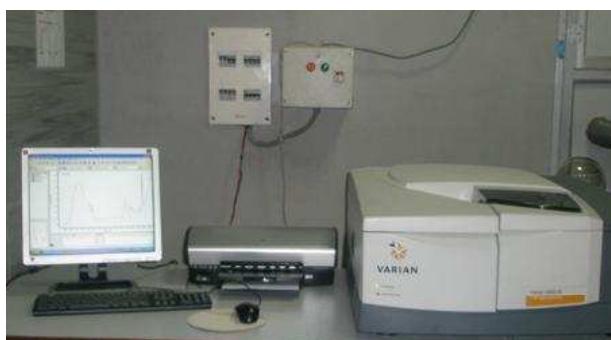
FTIR Spectrophotometer (Spectrum M GX PE model 2000)