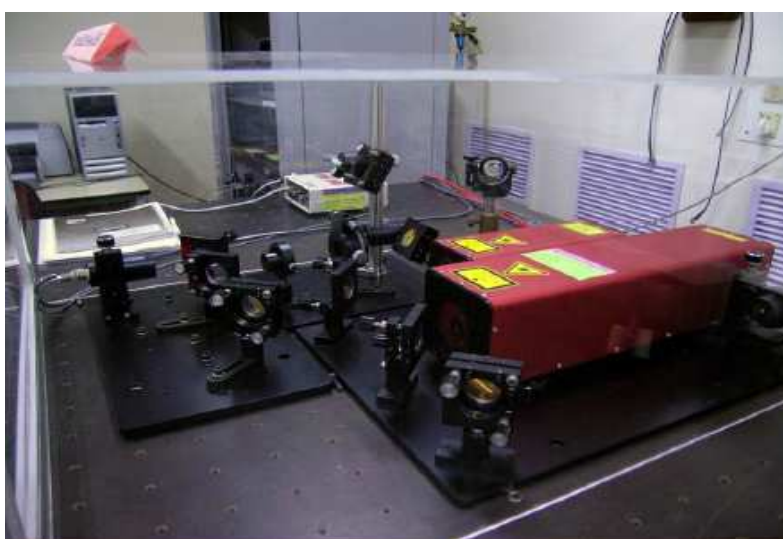
Iodine frequency Stabilized He-Ne Laser, to realise SI unit Metre