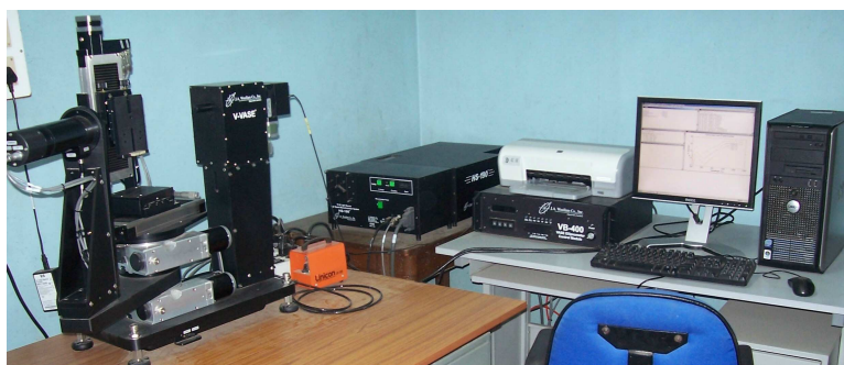
Variable Angle Spectroscopic Ellipsometer