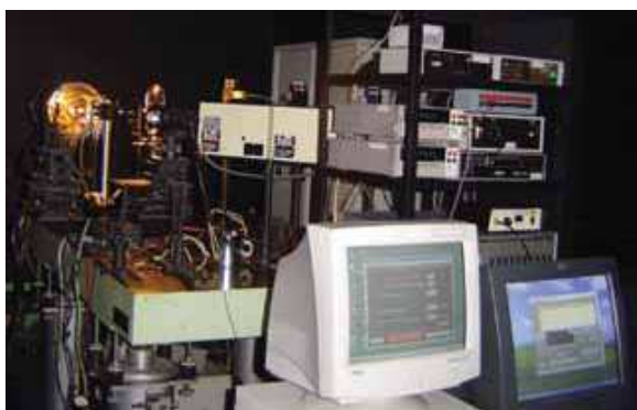
Set up of the Black Body for optical radiation standard