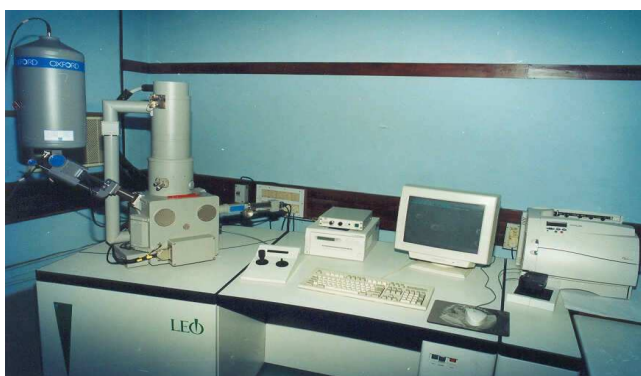
Scanning Electron Microscope (LEO 440 with Oxford ISIS 300 EDS)