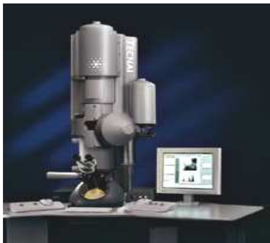
Analytical High-Resolution TEM (Tecnai G² F30 STWIN) with STEM and EDAX