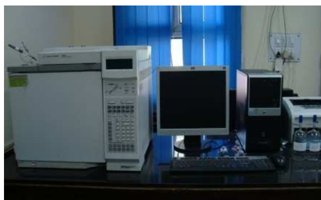
Gas Chromatography with FID and ECD detectors (Agilent 6890)