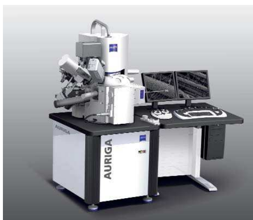
Field Ion Beam & Field Emission SEM