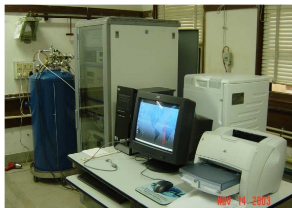
Quantum Hall Resistance (Primary Standard of Resistance)