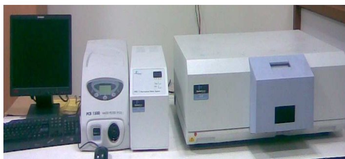
Photoluminescence spectrometer (Perkin-Elmer LS-55)