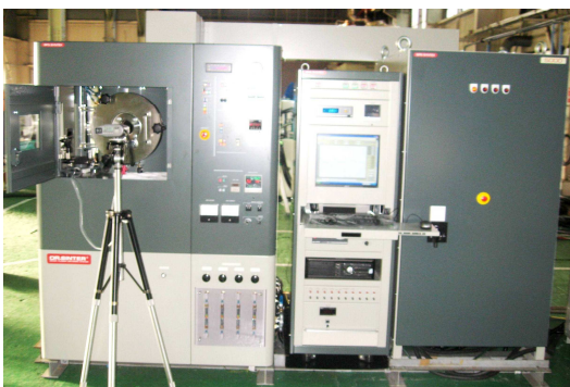
Spark Plasma Sintering Unit