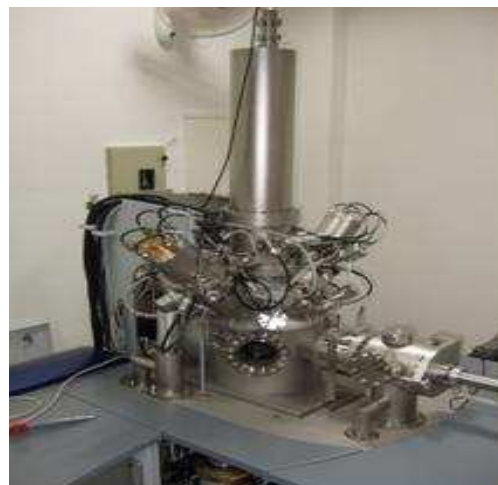
Time-of-Flight Secondary Ion Mass Spectrometry