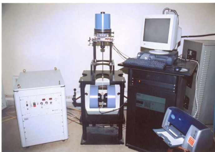
Vibrating Sample Magnetometer